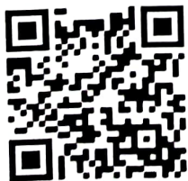
QR Code for Hospital Location