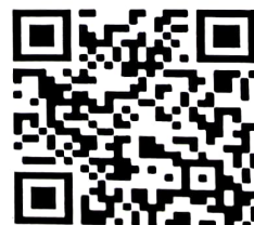
QR Code for Registration