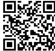
QR Code for Registration